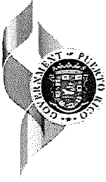
EXHIBIT D – SECTION 1