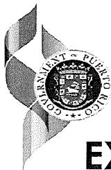
EXHIBIT D – SECTION 1