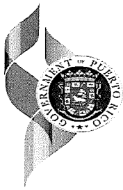
EXHIBIT D ADMINISTRATIVE FUNDS ASSIGNMENT FOR MUNICIPALITIES NON-CONFLICT OF INTEREST CERTIFICATION MUNICIPALITY OF LAS MARÍAS

The Subrecipient certifies that to the best of its knowledge: