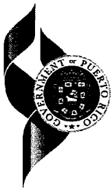
EXHIBIT G SUBROGATION AND ASSIGNMENT PROVISIONS SMALL BUSINESS INCUBATOR AND ACCELERATOR PROGRAM CENTRO PARA EMPRENDEDORES, INC.