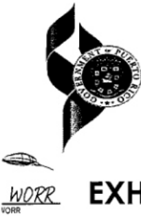
EXHIBIT A SCOPE OF WORK CITY REVITALIZATION PROGRAM MUNICIPALITY OF VILLALBA

The Puerto Rico Department of Housing ( PRDOH ) has established the following Scope of Work as part of the SRA between PRDOH and the Subrecipient for the City Revitalization Program ( Program ) as part of the Community Development Block Grant for Disaster Recovery ( CDBG-DR ) Program.